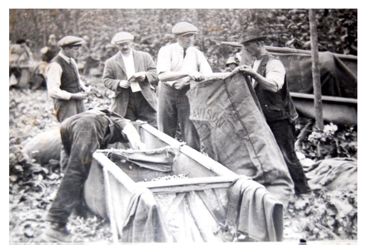
Figure 1: The Davison Farm Tunbridge Wells, England early 1900s

hops and mixed farming on the family property. After the passing of their father on